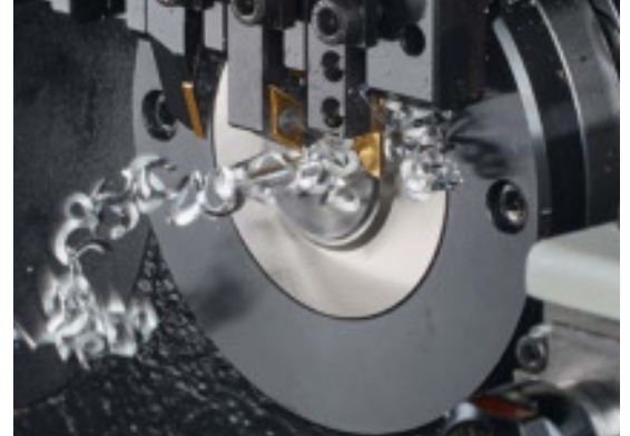
Without active chip breaker