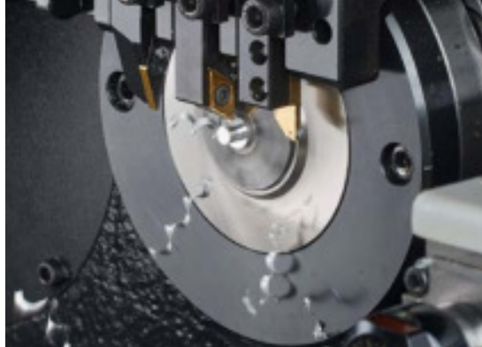
With active chip breaker