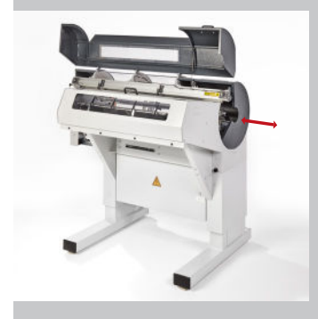
Small footprint, since only the upper section of the loading magazine is displaced.