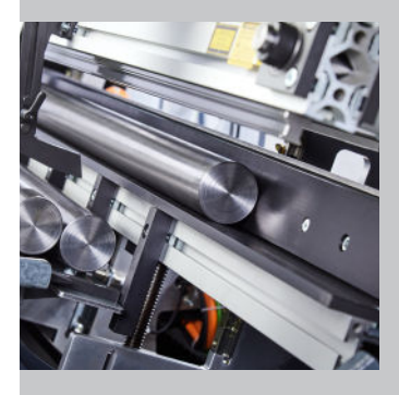
Continuous "V-Channel" for the efficient feeding of short bar sections.

Mobile control panel with integrated magnetic holders for flexible attachment in the operator's working environment.